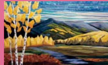
Mountain Meadow at Lubbesmeyer Gallery

The Lubbesmeyer twins offer a range of work created in fiber and paint. Through the twins' collaborative process, they distill literal imagery into vivid blocks of color and texture, creating an abstracted view of their surroundings. Working studio / gallery open Tuesday thru Saturday.