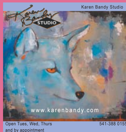
Karen Bandy Studio