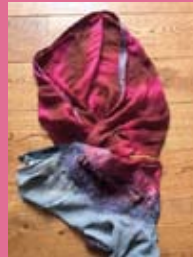
Wearable art by Tricia Biesmann & Lucinda Summerfield

For Tricia Biesmann and Lucinda Summerfield of The Way We Art, creating beautiful wearable art is a real joy. They use a nuno felting process of combining natural materials with unspun yarn (roving) by wet felting them together until they are bonded. Colors, textures and imagination know no boundaries! They are grateful to their friends in Thailand, Ireland and Shanghai for inspiration for this show.