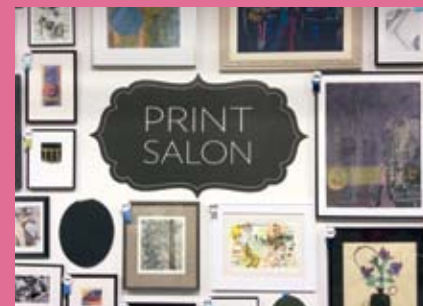
A6 Print Salon

Admission is free to the A6 Gallery. Mondays-Fridays 10-7pm, Saturdays 10-6pm and Sundays 12-5pm.