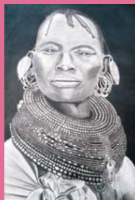
Visions of Hope—African Woman