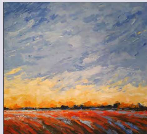
Autumn Light, 2016, Acrylic on canvas, 37 x 37 framed