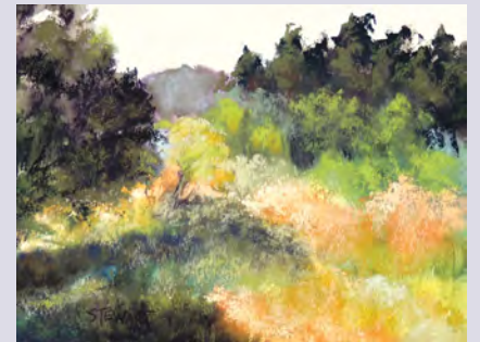
Summers Bloom by Marty Stewart

En plein air is a French expression which means in the open air, and is particularly used to describe the act of painting outdoors. The Plein Air Painters of Oregon is a regional organization of artists who are passionate about painting on location. Members enjoy the camaraderie and security of painting with others in a group environment while endeavoring to produce the luminous quality of out-of-doors light in their art. These artists brave cold, heat, wind, mosquitoes and more to capture a fleeting moment in time. Founded in 2003, the group meets for frequent paint-outs during the warmer months of the year.