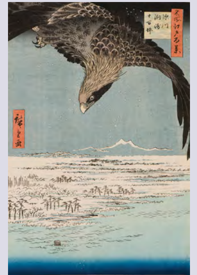
Hiroshige Husaki and the Jumantsubo Plain near Fukagawa 1857

Admission to the exhibit is free - program costs vary. The exhibit is available during regular gallery hours: Monday-Friday 10-7pm, Saturday 10-6pm and Sunday 12-5pm.